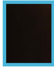
US Antique Dark

* Pictures of finishes might differ from reality.